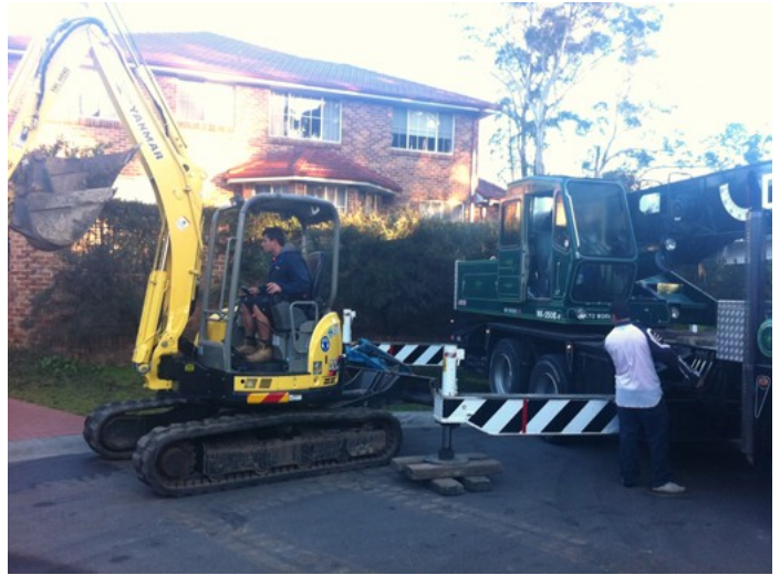
Getting ready to be hooked up to the crane

We removed the dirt from the site by reversing the trucks up onto the nature strip and the 5.5 ton excavator simply loaded the vehicles over the wall.