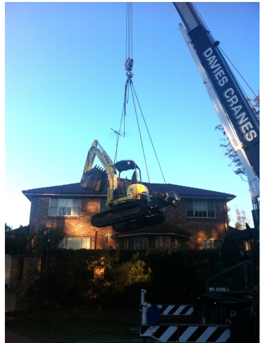
The excavator being craned over the wall