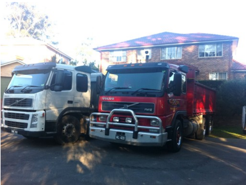
The trucks lined up waiting to be loaded over the wall.