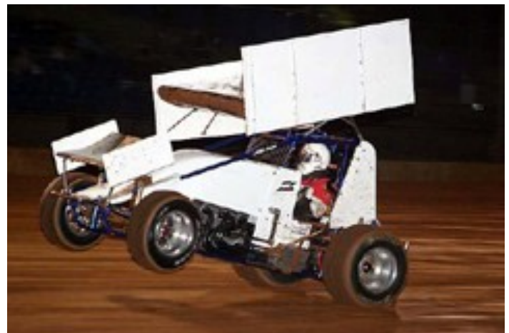
We sure do hope he doesn't drive our trucks this way