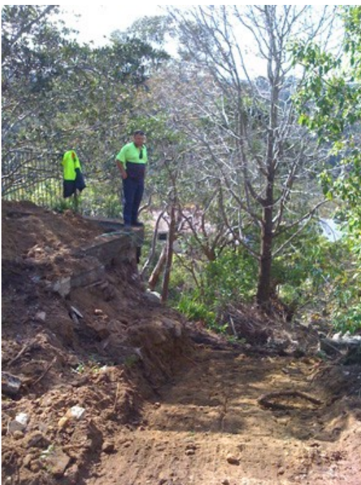
The excavation 6 metres below ground level