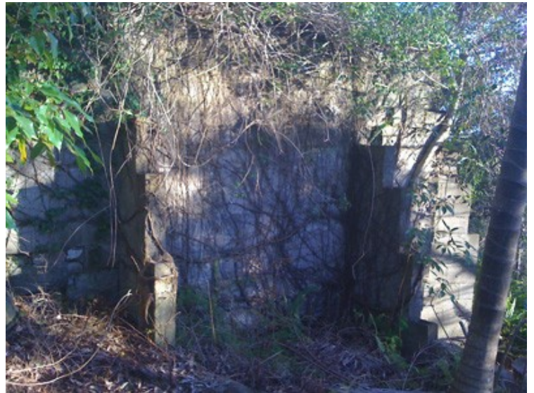
Existing retaining wall falling down

RME was contracted by Aqua Leisure Pools to replace a retaining wall using sandstone blocks 3.5m x 1.5m x 1m in size. The wall had to be built 6 metres below ground level requiring a 14 ton excavator to remove the dirt allowing the blocks to be placed. A rock saw was used to cut the blocks into smaller sizes with the 14 tonner shifting them to the lower ground. On completion, agg line and mesh was placed for drainage then back filled with aggregate.