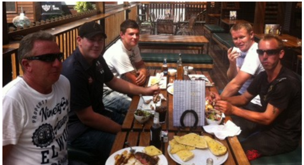
The Boys @ RME enjoying Christmas lunch at The Mean Fiddler

Well here we are into another year already. We trust you all had a safe and happy Christmas and enjoyed the New Year celebrations. Many thanks to the crew at RME for making 2010 a successful year and also to our existing Pool Companies who keep us digging all year round. We attended a few Christmas parties in December and shared a few bourbons with our Industry friends and associates. Its always a great way to wind down the year and socialise with our co-workers. Here's to a happy 2011.