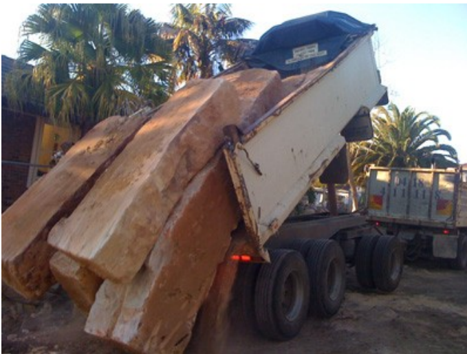
Sandstone blocks delivered