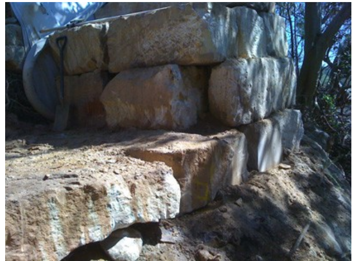
Placement of sandstone blocks